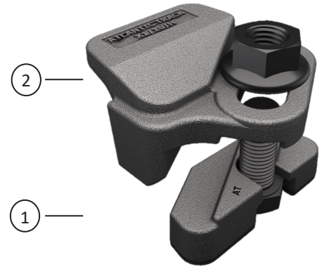
1. Welded Clip Base 2. Clip Cap with integral rubber nose